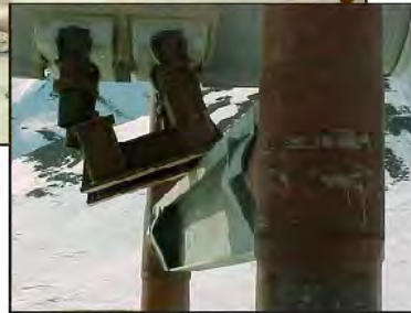
Atigun Pass, 2000. MP 170.