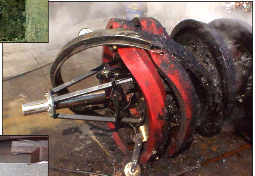
Valdez, July 2000: Instrument pig with 500-lb. Steel ring ripped from a check valve near Fairbanks and carried 350 miles to Valdez.