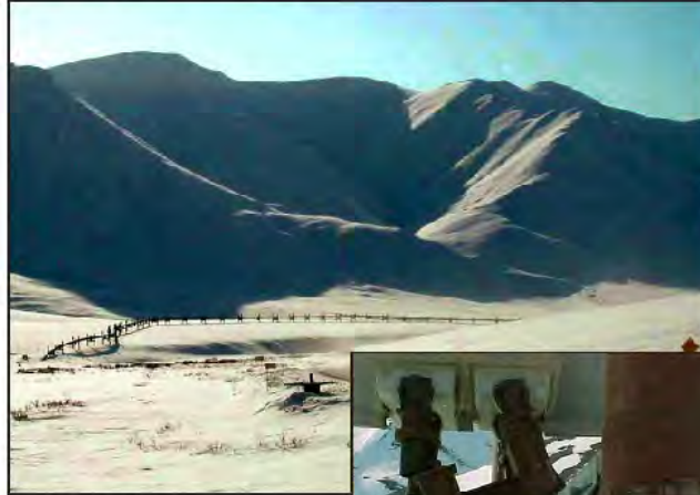
Atigun Pass, MP 170

A Status Report on the Trans-Alaska Pipeline System