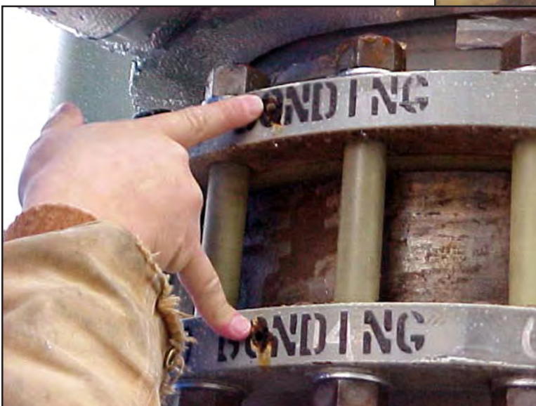
Valdez, November 2000: A technician mistakenly attaches bonding strap to loading arm at Berth 4 resulting in a “near miss” spark.