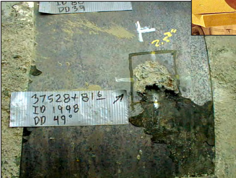
Near Copper Center, August 2000: Alyeska discovers construction-era damage—gouges in the steel that had been covered up with cement.